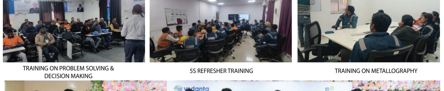
TRAINING ON PROBLEM SOLVING & DECISION MAKING